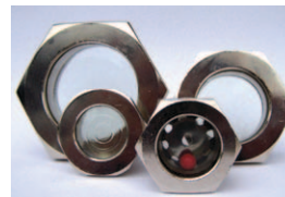
Additional Sight Glasses