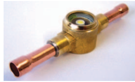
Sight Glass Solder Connection

Manufactured in accordance with AS1677.2