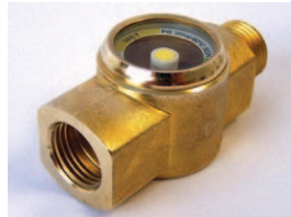
Sight Glass Male Flare x Female Flare