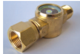
Sight Glass Male Flare x Female Flare Swivel