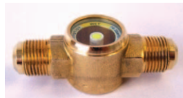
Sight Glass Flare